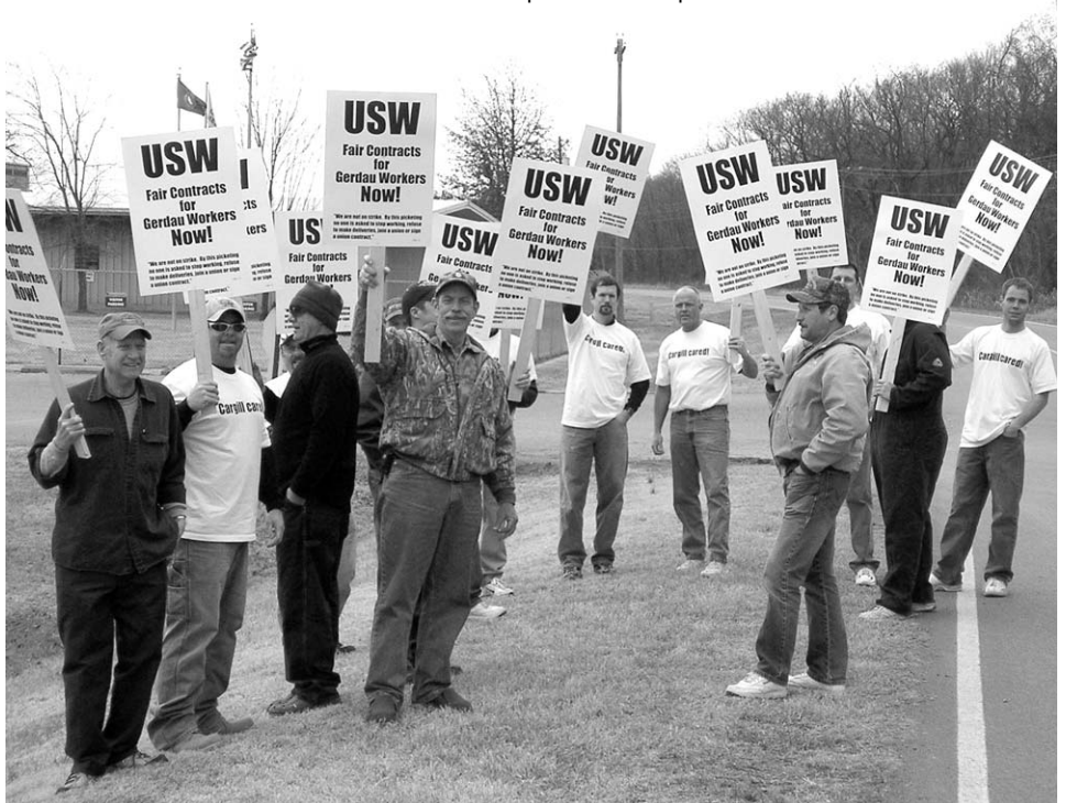
Showing Solidarity for steelworkers at three plants where contracts have expired, local 9447 members hold informational picket outside plant.

The most recent union meeting following the unity council meeting in St. Paul, saw more than 50 percent of the members in attendance, remarkable for a Local not in negotiations but a powerful signal that the Local is united with the Council.