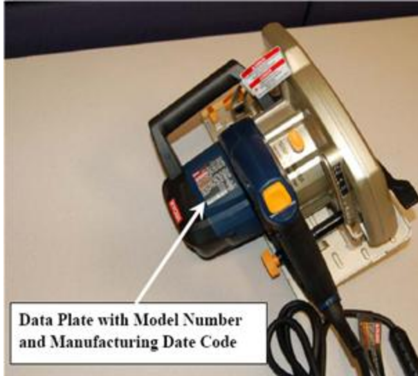
Data Plate with Model Number and Manufacturing Date Code